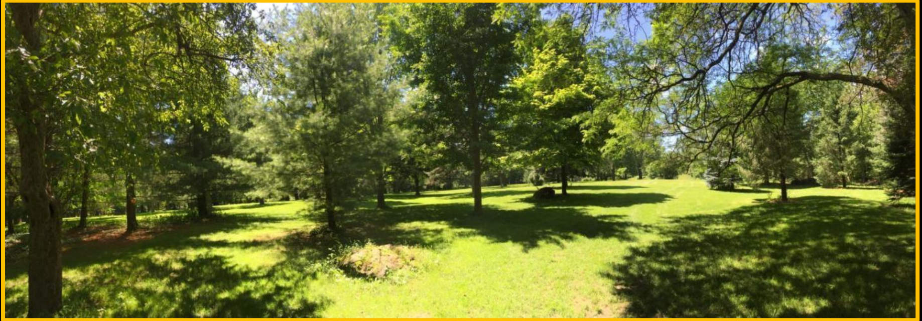
The upper garden