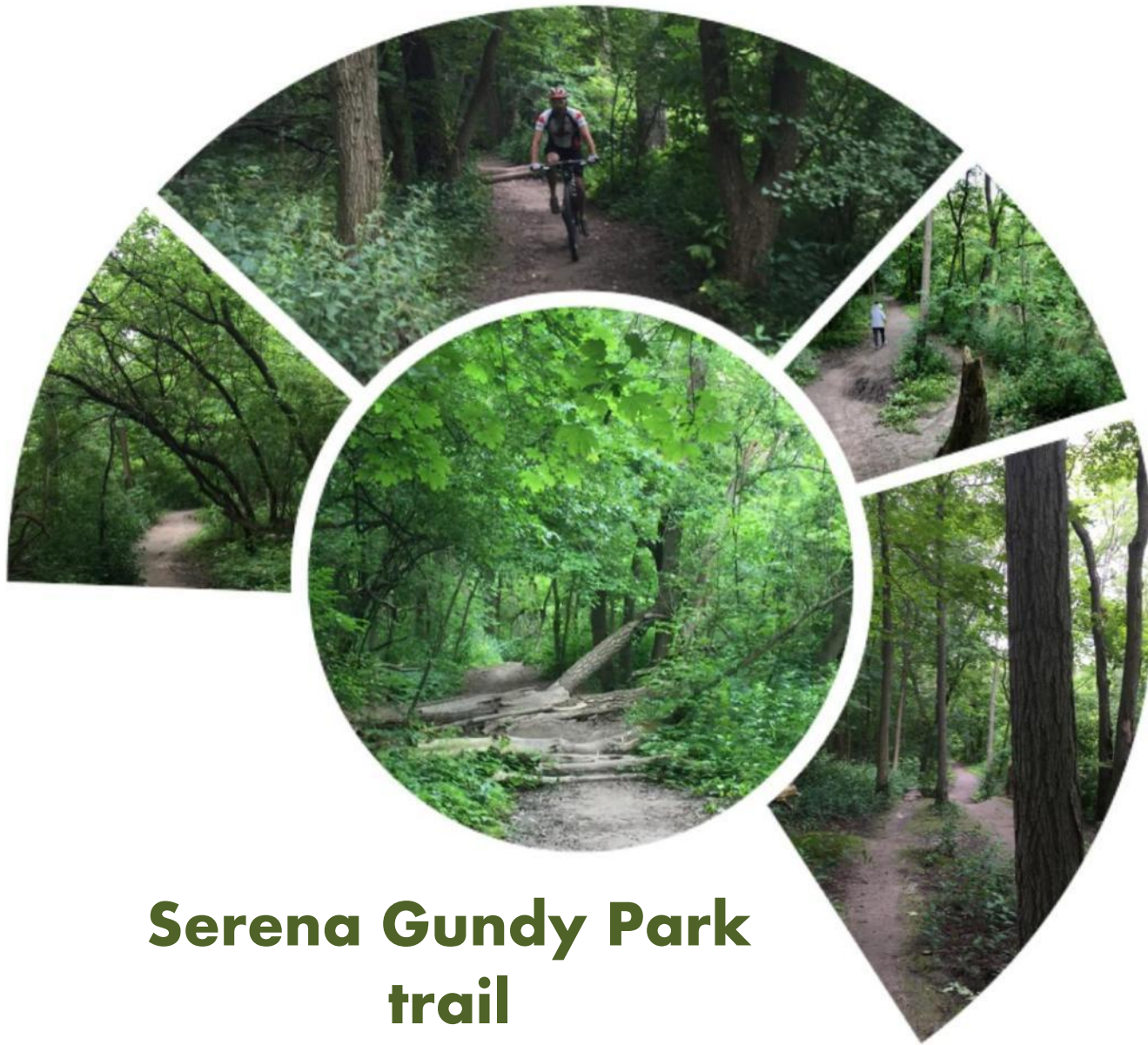
Serena Gundy Park trail