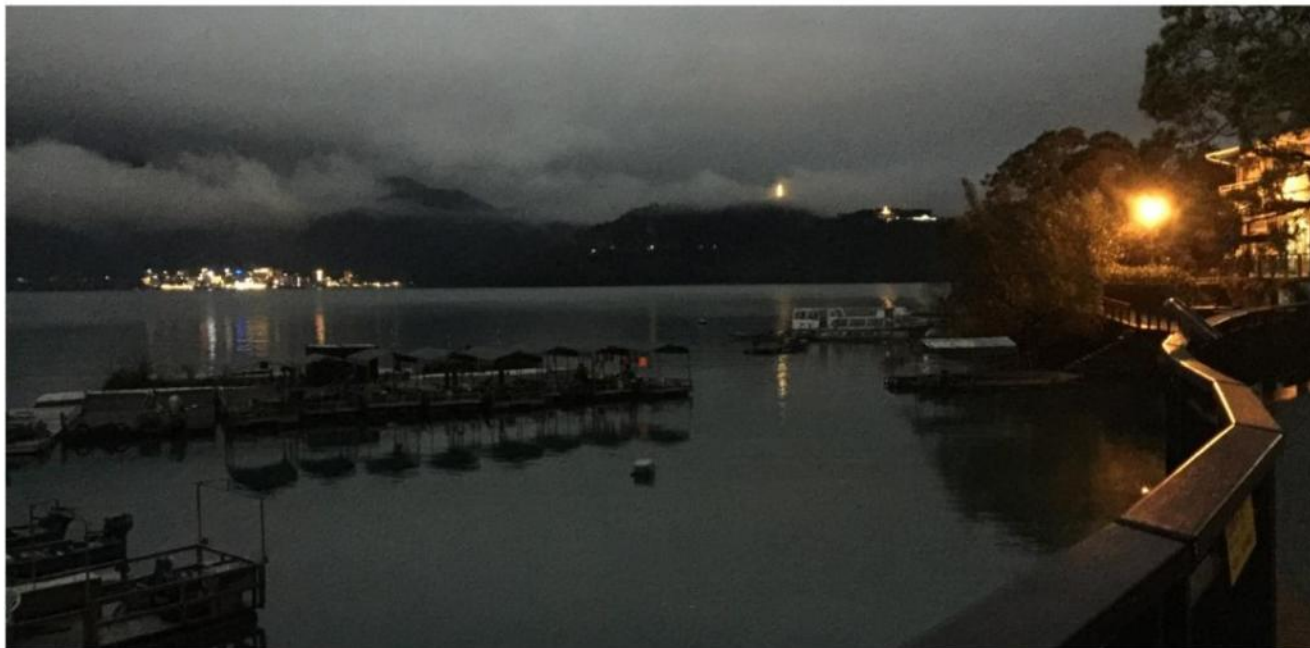
The temples in the distance