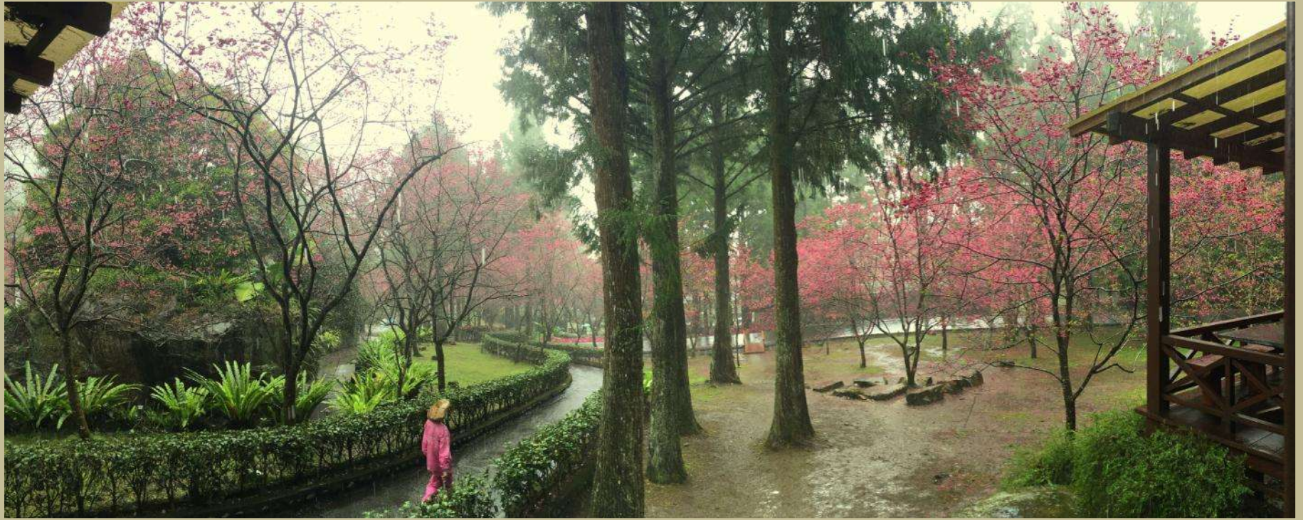
Blossoming trees filled the huge park