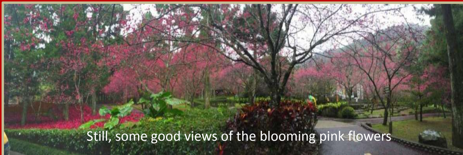
Still, some good views of the blooming pink flowers