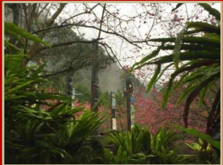
An aboriginal touch too