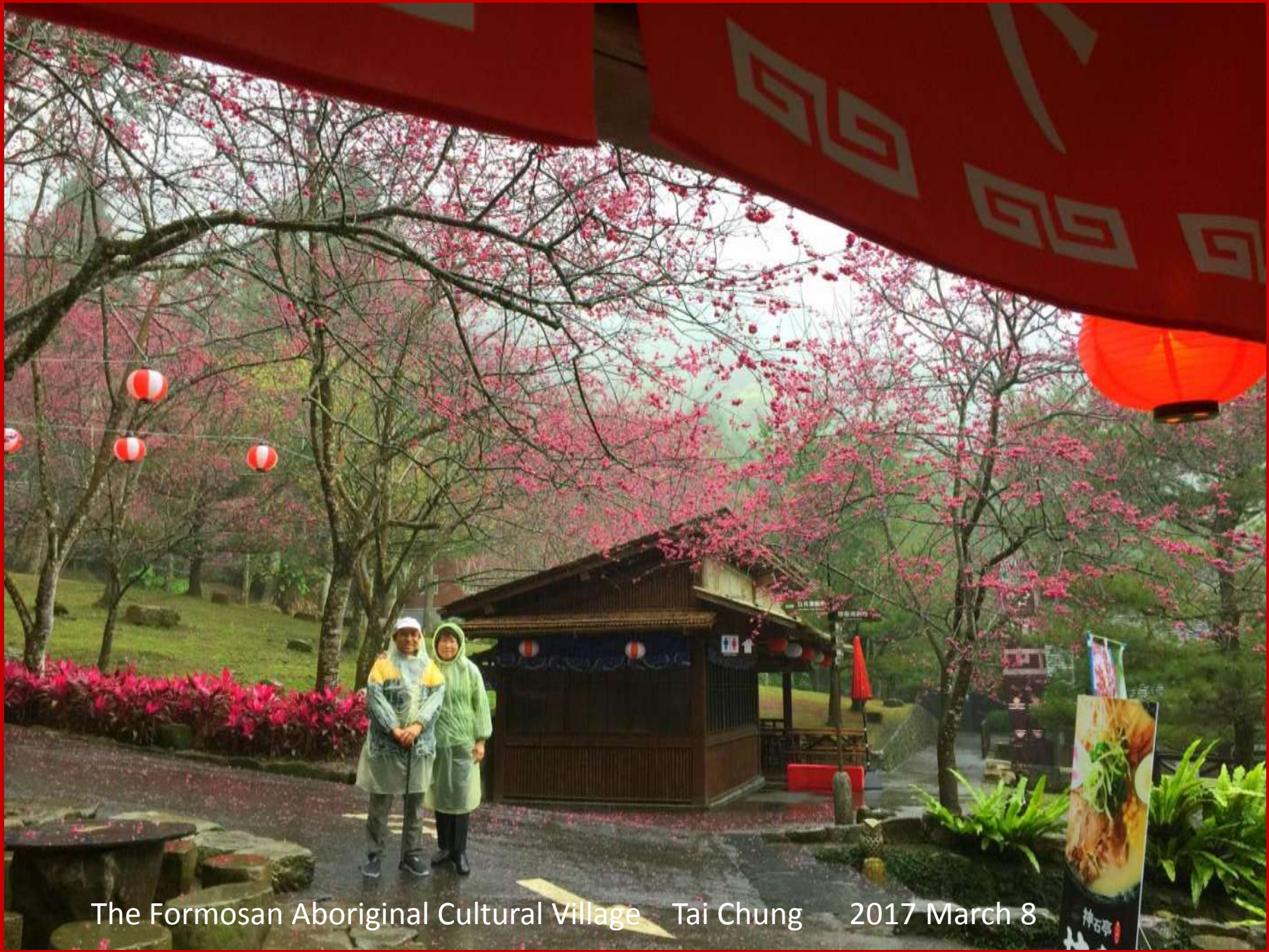
The Formosan Aboriginal Cultural Village Tai Chung 2017 March 8