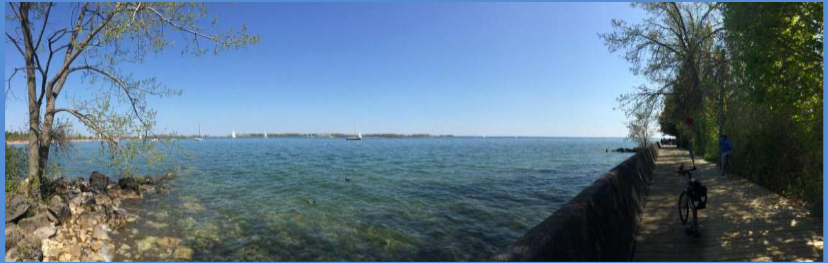
The Eastern Channel is a stone's throw away