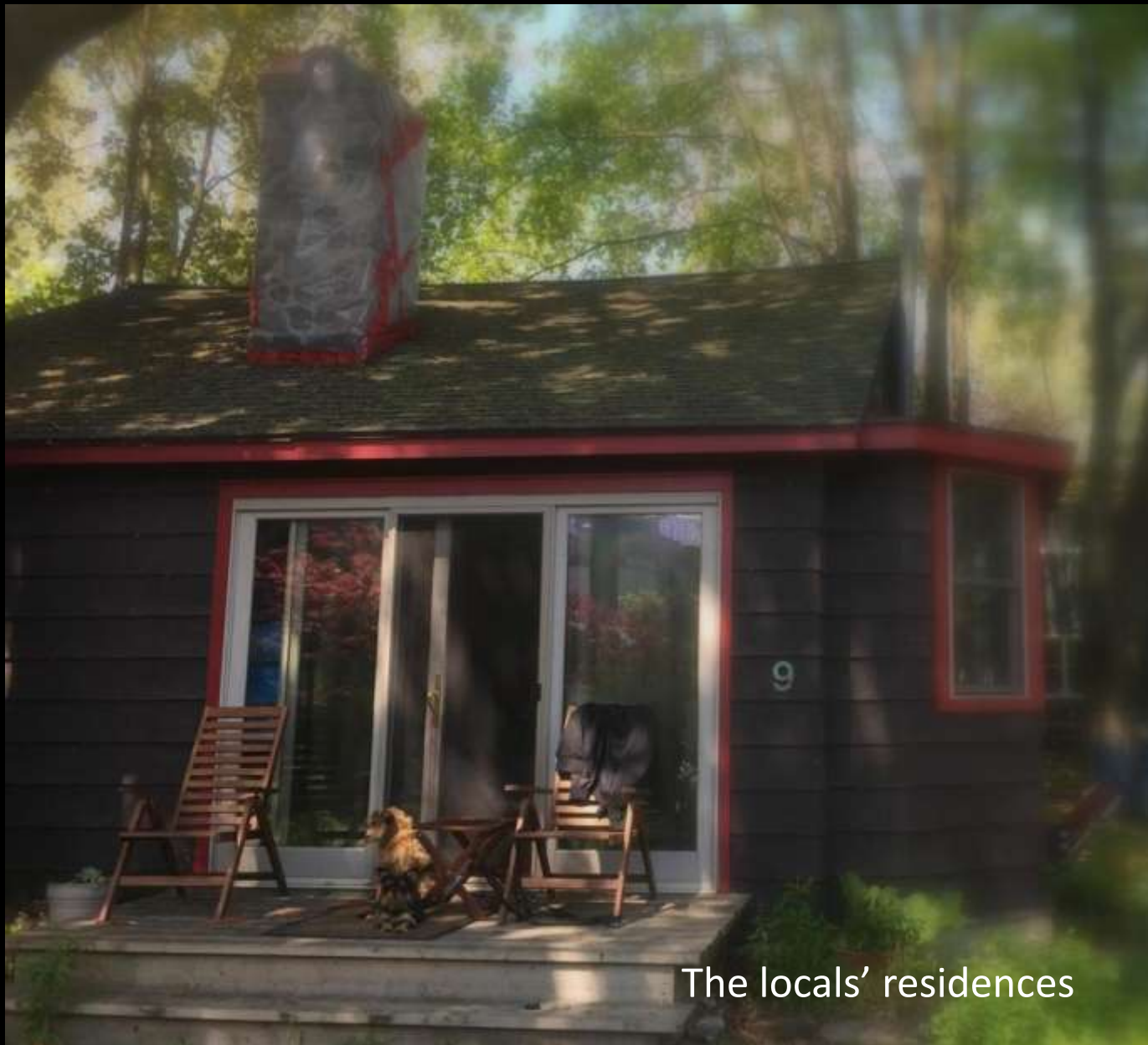
The locals' residences