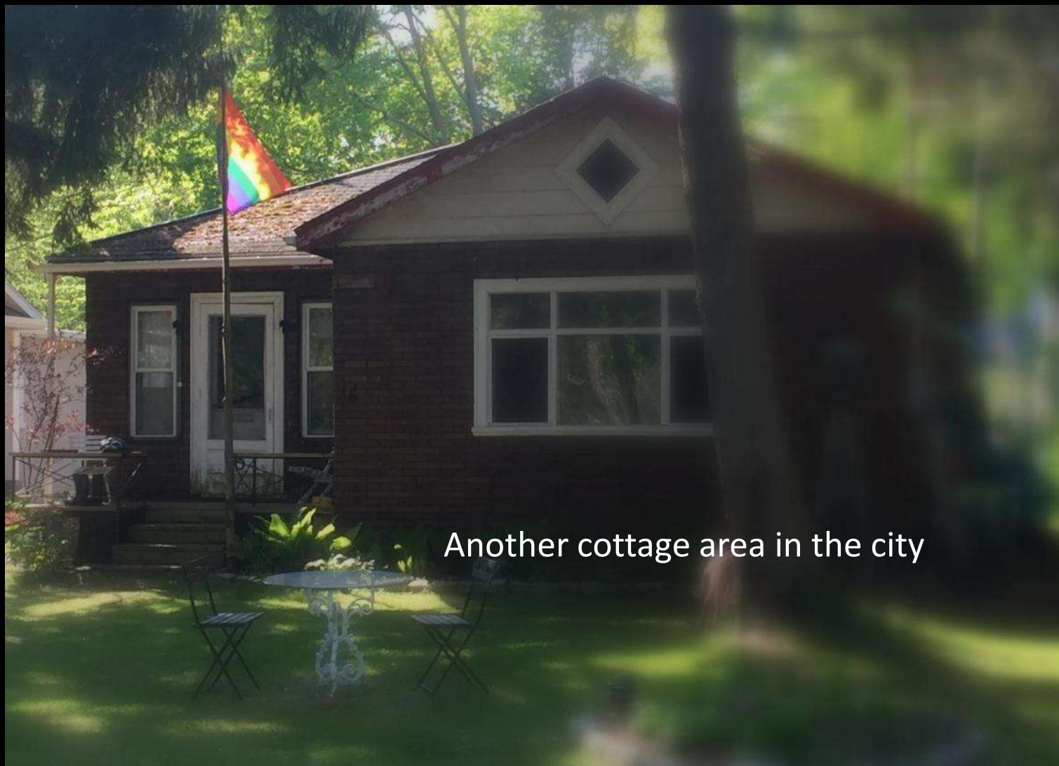
Another cottage area in the city